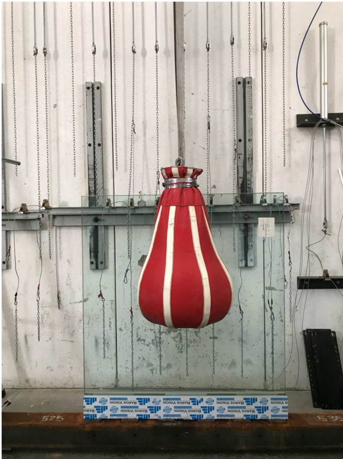
Photograph of the item after impact on the center of the glazing with dynamic load according to standard UNI 10807:1999