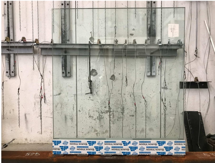
Photograph of the Item