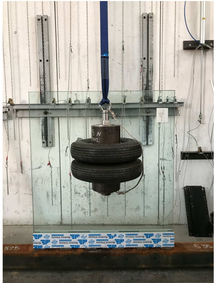
Photograph of the item after impact on the center of the glazing with dynamic load according to standard UNI EN 14019:2016