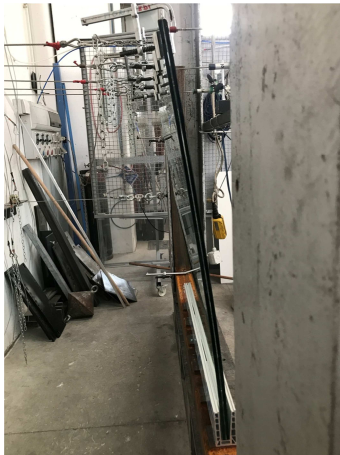
Photograph of the item undergoing horizontal linear static loading