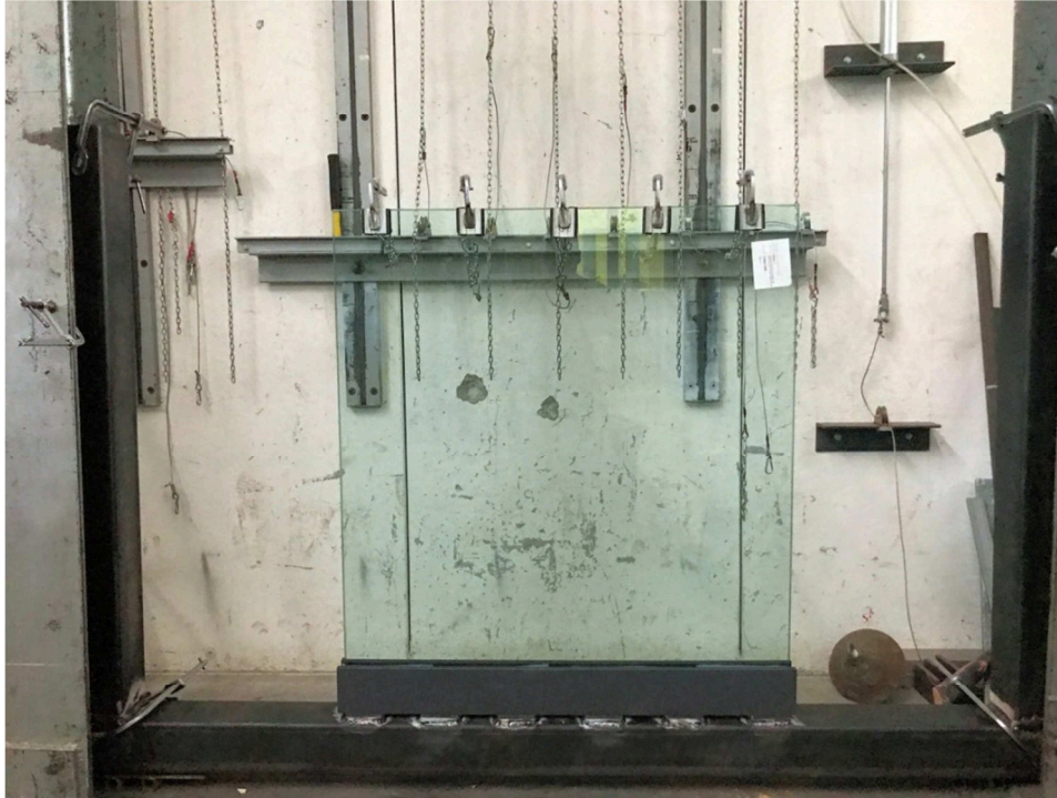
Photograph of the item