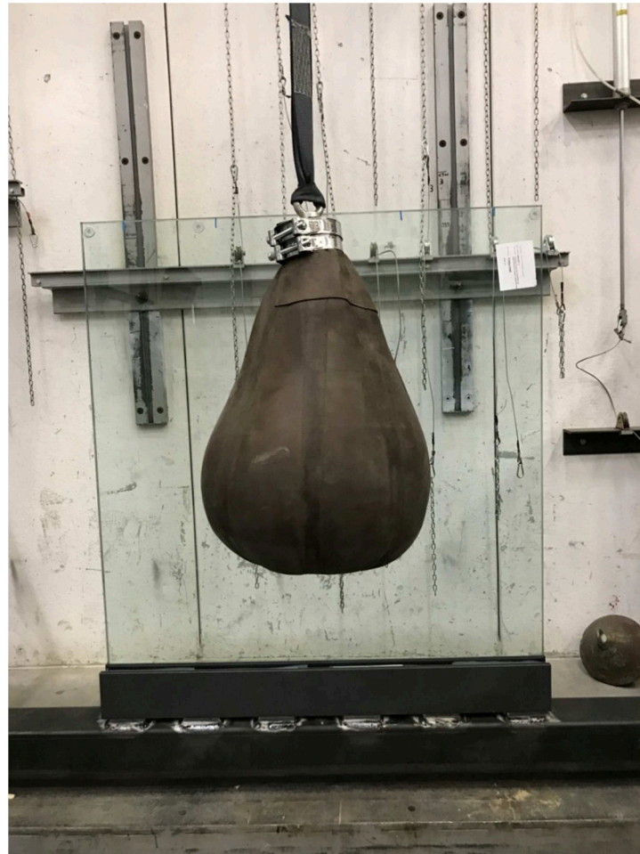
Photograph of the item after impact in the center of the glass

No item performance loss compared to design specifications was witnessed.