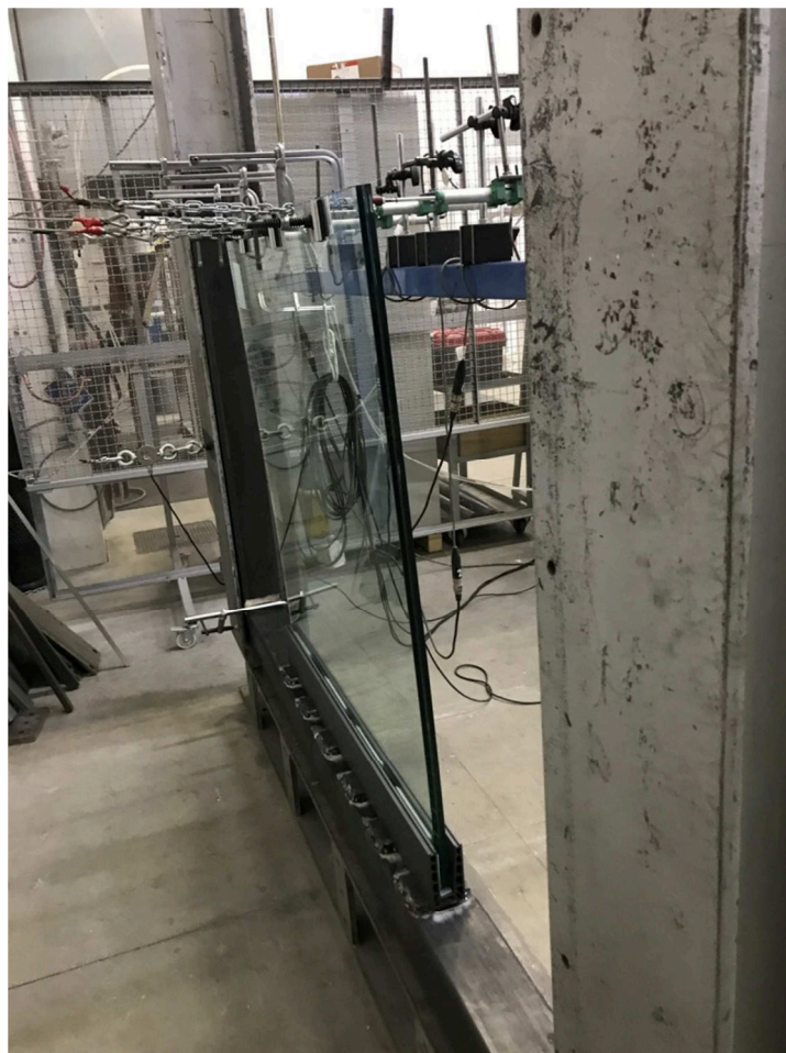
Photograph of the item during resistance to outward horizontal static loading test

(***) safety load with coefficient of 1,7 for aluminium.